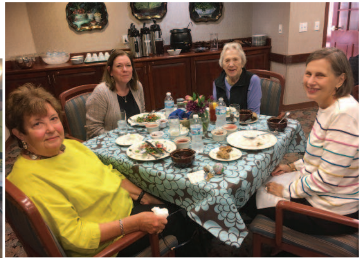
Members enjoy lunch after arranging the flowers.

Residents shopping with Turner Construction Volunteers "Paint the Town Blue"