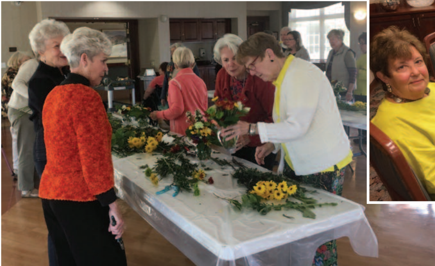
Le Jardinier club members arrange flowers for the residents of Beechwood.