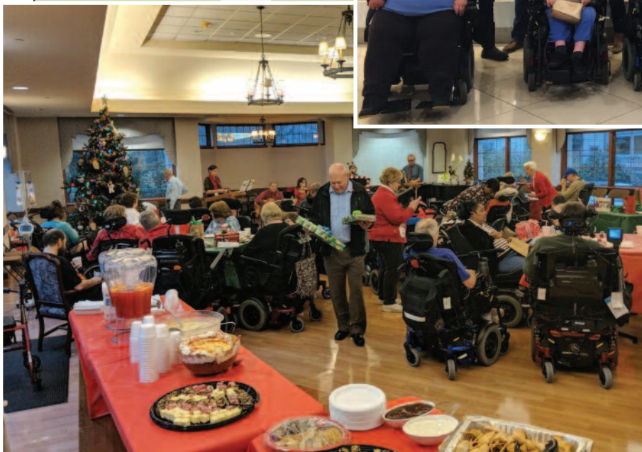
Residents enjoying the Christmas Party