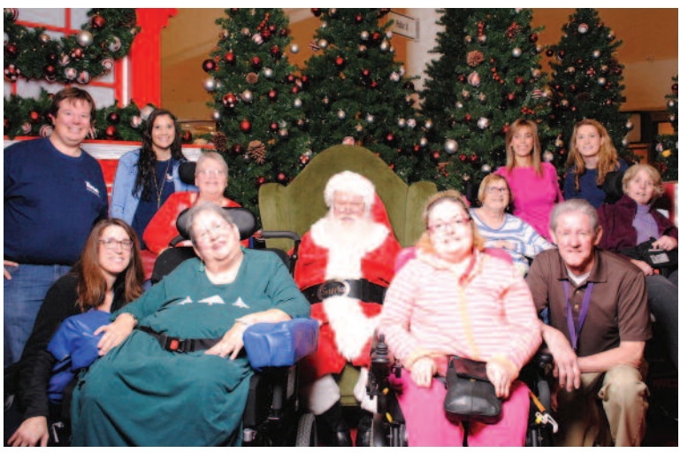
Turner construction employees volunteered their time to help some Beechwood residents do their shopping for Christmas.

Santa, compliments of Turner Construction, visited Beechwood.