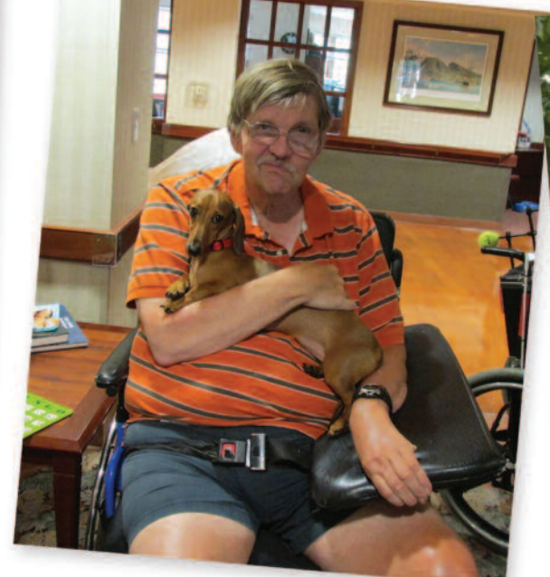
Resident enjoying some canine company