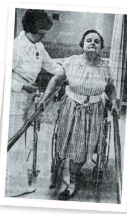
Resident receiving therapy